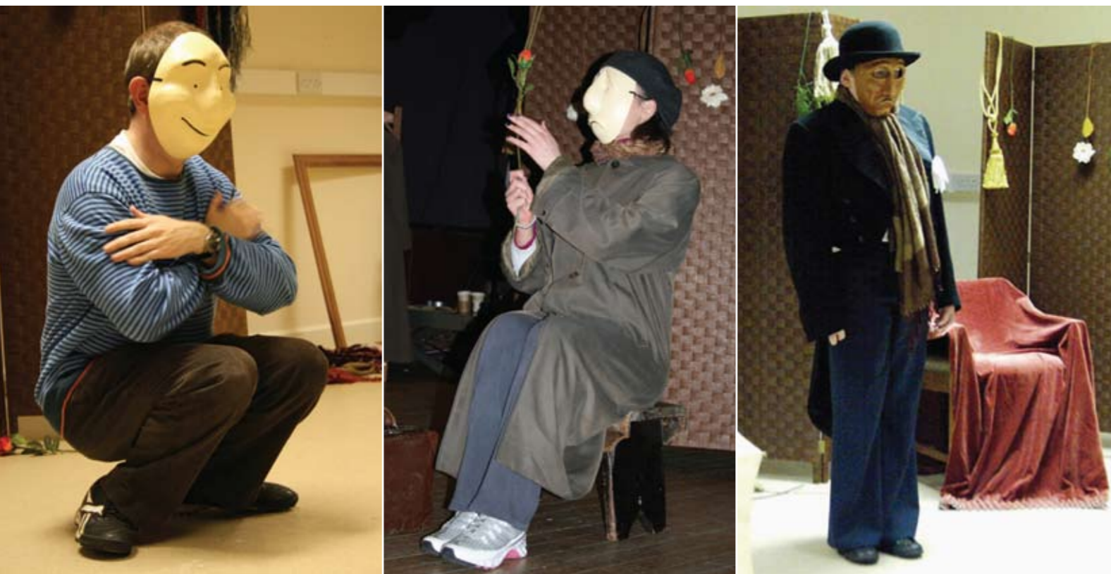
Members of Scannán film-makers' group participating in a Lawnmowers Independent Theatre Company workshop, Ballina, 2009