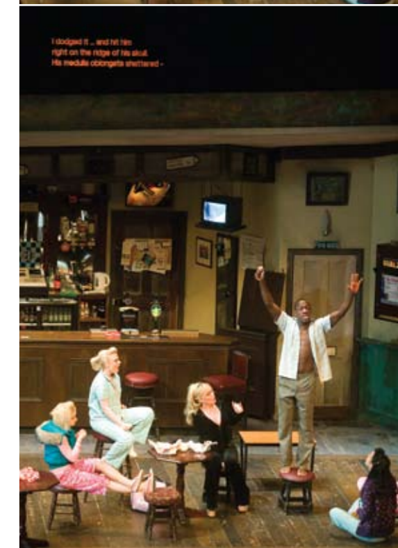
Above: Two scenes from a captioned performance of the 2007 Abbey Theatre production of The Playboy of the Western World